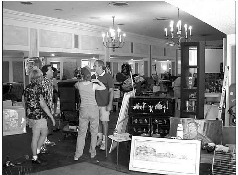
The scene at the 3rd annual East Village Linden Avenue block sale.

Please be sure to notify Sharon or a board member as soon as possible if you happen to lose any items down the gap, this will avoid possible damage to the elevator mechanism!